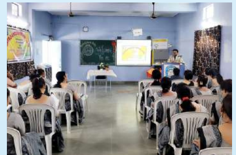
POCSO Seminar - 2023