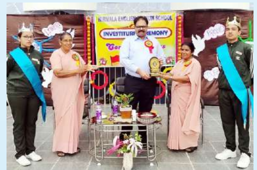
Investiture Ceremony - 2023