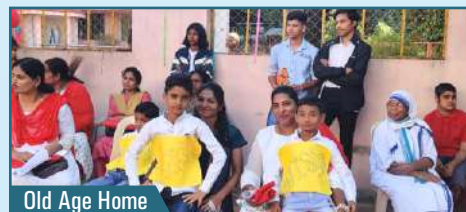
Old Age Home