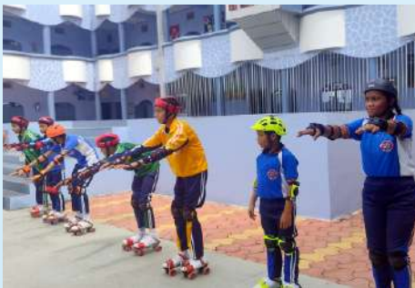
Skating - 2023