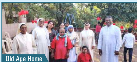
Old Age Home