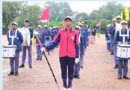
Band - 2023